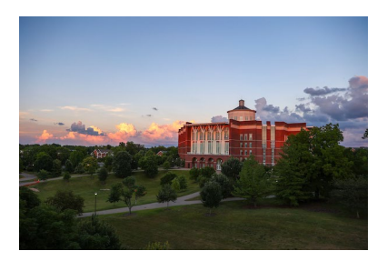
William T. Young Library, University of Kentucky campus, July 2024

UK Libraries is a comprehensive research library system, offering millions of online and hardcopy materials (2.5 million eBooks!), hundreds of research databases, 222,000+ journal subscriptions, seven library buildings, a team of social science librarians (and other subject teams), chat and email reference services, online instruction, one-on-one research consultations, help with systematic reviews, and interlibrary loan.